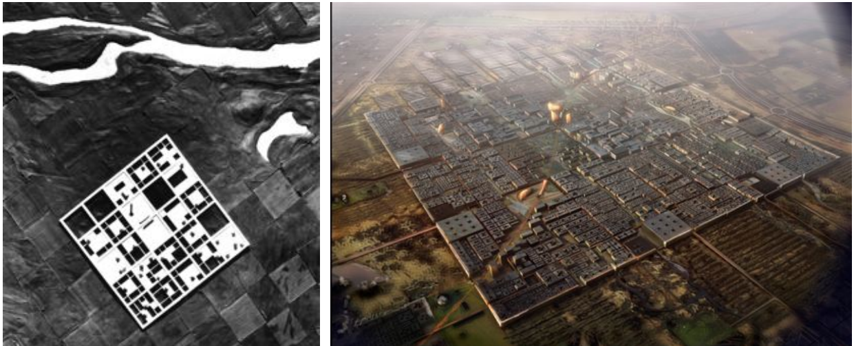
left: Agricultural City Plan, Kisho Hurokava, 1960

The Archigram group brought to the world 'a vision of the city as an environment conditioning our emotions' (Living Arts, no. 2), 'Living City', presented under the form of a manifest-exhibition in 1963. A manifesto for their belief 'in the city as a unique organism', which is more than a collection of buildings, but a means of liberating people by embracing technology and empowering them to choose how to lead their lives.(Sadler, 2005)